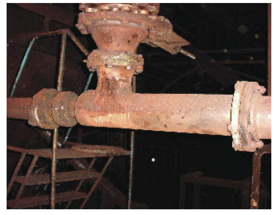
The venturi eductor has no moving parts, seals, or bearings, eliminating the chance for wear, increasing operator safety, and making it ideal for the company's application.

The company needed to quickly and efficiently move 6 to 7 t/h of copper calcine dust through more than 200 feet of piping without exceeding its budget with costly repairs or replacement equipment.